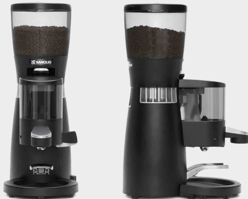
KRYO 65 AT / 65 ST