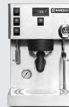
SILVIA PRO X