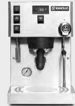
SILVIA PRO X